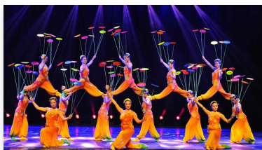
Romantic Show of Song- Cheng US$105