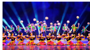
Shanghai Chinese Acrobatic Show US$105