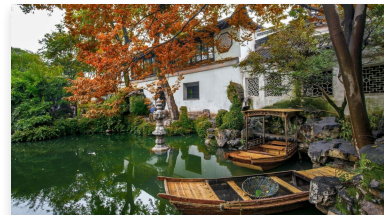
Wuxi Grand Canal Cruise US$55