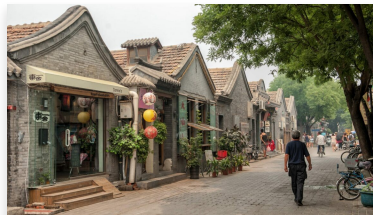
Hutong Life Tour US$79