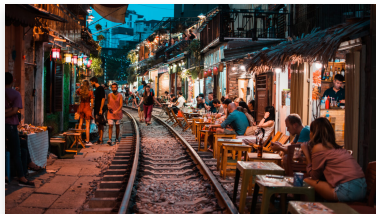
Hanoi Street Food (Dinner included) US$85