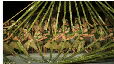
Hoi An Memories Show US$116