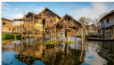
Tonle Sap Lake Tour US$136