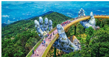
Golden Bridge Tour US$183