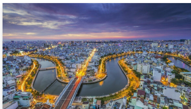
Dinner on Saigon River Cruise US$135