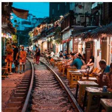
Hanoi Street Food (Dinner included) NZ$90