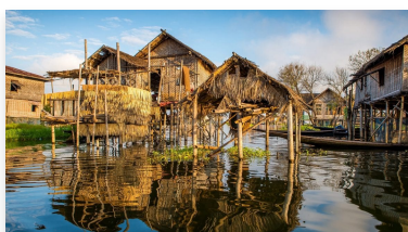
Tonle Sap Lake Tour NZ$149