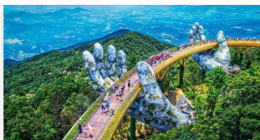
Golden Bridge Tour (Lunch Included) NZ$201