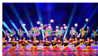
Shanghai Chinese Acrobatic Show NZ$105