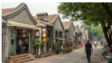
Hutong Life Tour NZ$39