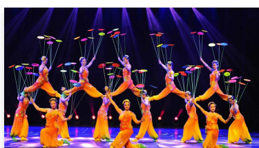
Romantic Show of Song-Cheng NZ$109