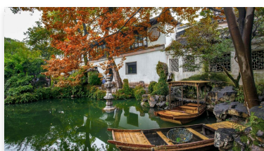
Wuxi Grand Canal Cruise NZ$65