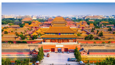
Forbidden City Tour NZ$85