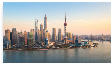
Shanghai Insight Tour NZ$75