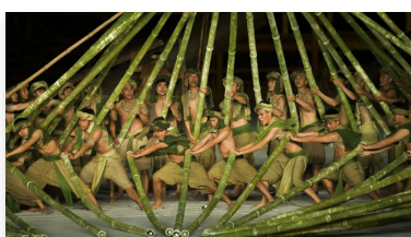
Hoi An Memories Show NZ$120