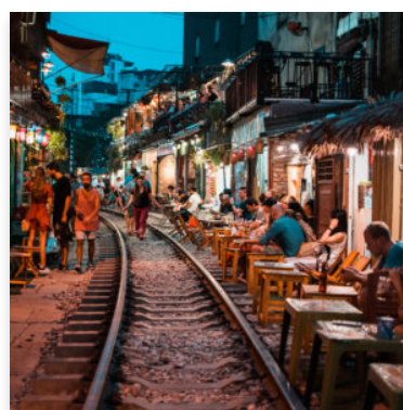
Hanoi Street Food (Dinner included) NZ$90