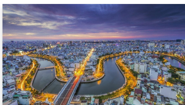
Dinner on Saigon River Cruise NZ$123