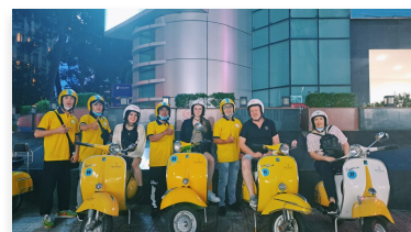
Vespa Adventure - Saigon after Dark Tour NZ$245