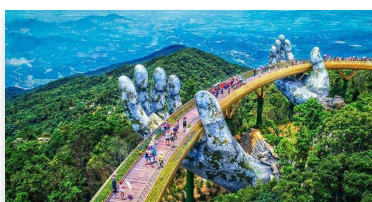
Golden Bridge Tour (Lunch Included) NZ$201