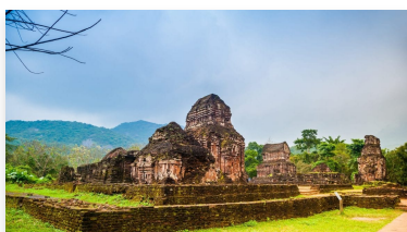
My Son Sanctuary and Thanh Ha Village Tour NZ$102