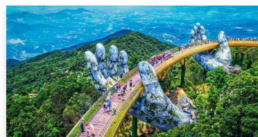
Golden Bridge Tour (Lunch Included) NZ$201