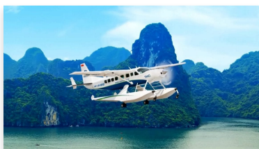
Halong Seaplane NZ$210