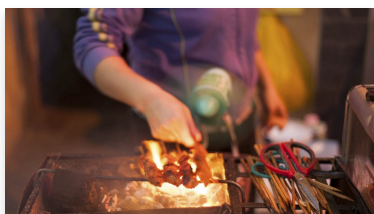
Hanoi Street Food (Dinner Included) NZ$70