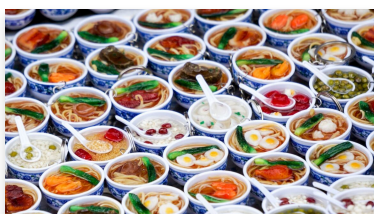
Hoi An Cooking Class Tour AU$112