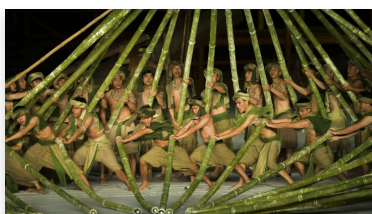
Hoi An Memories Show AU$116