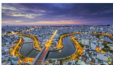
Dinner on Saigon River Cruise AU$135