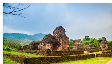
My Son Sanctuary and Thanh Ha Village Tour AU$93