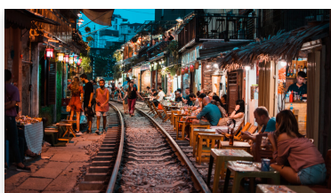
Hanoi Street Food (Dinner included) AU$85