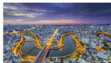
Dinner on Saigon River Cruise AU$135