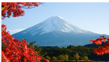
Kamakura & Hakone visited AU$415