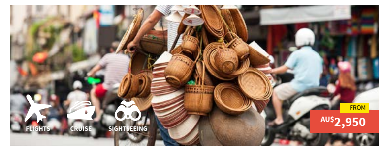
10 Day Highlights Of Vietnam Tour Code WHV Hanoi, Halong Bay, Hoi An, and Saigon

*Prices are on per person twin share basis and subject to change without notice.