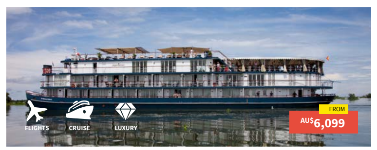
13 Day Vietnam & Cambodia with Luxury Mekong River Cruise Tour Code WMK13

Saigon, Mekong River Cruise, Phnom Penh, Tonle Sap Lake, and Siem Reap